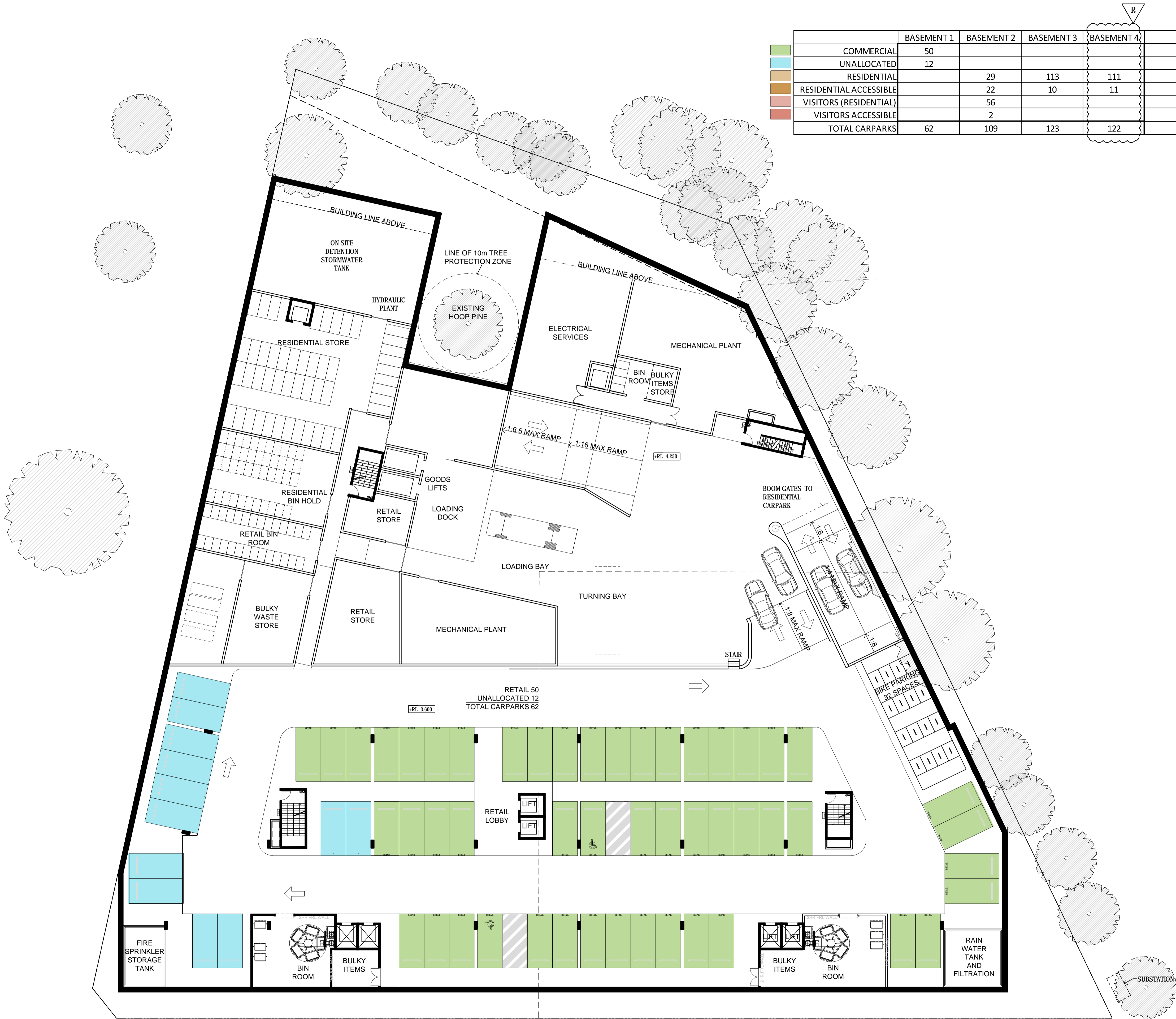
1 BASEMENT 1 PLAN scale - 1:200 @ A1